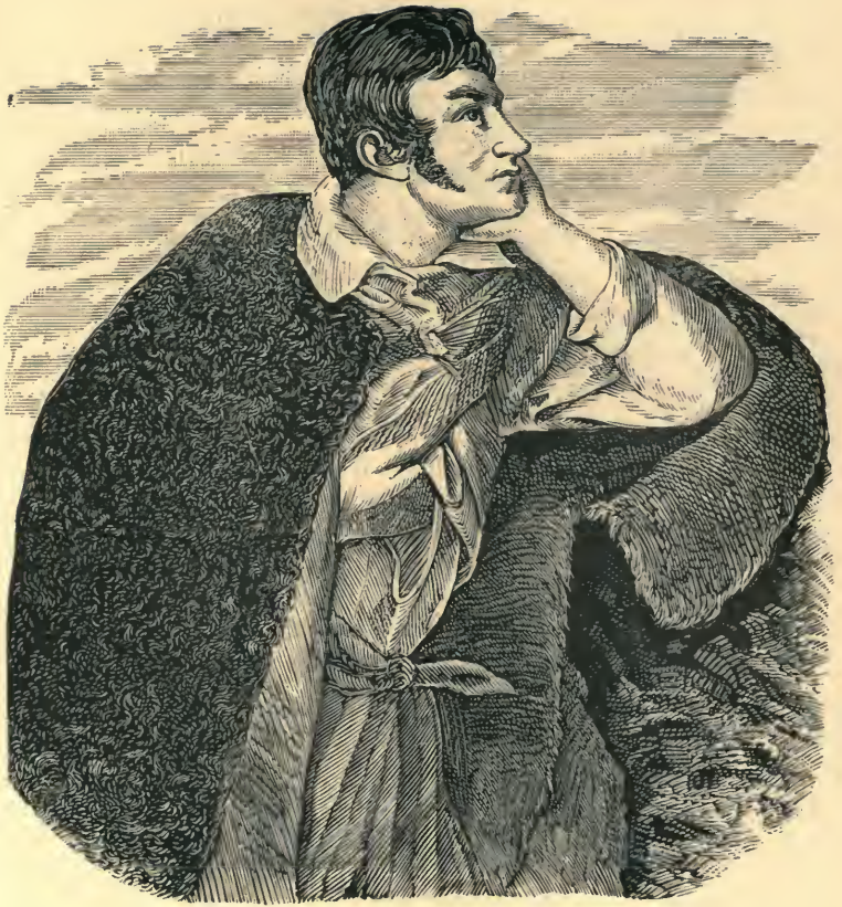
MICKIEWICZ. IN YOUNGER DAYS.